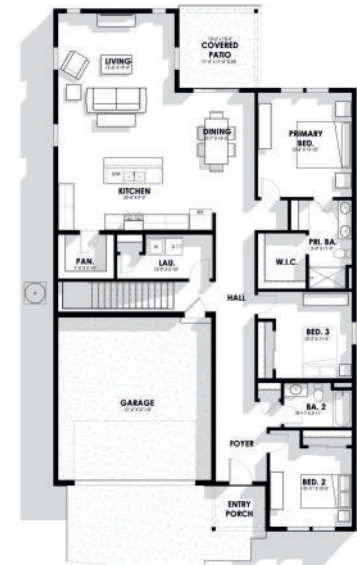
Main Floor Layout 1,803 SQ. FT.