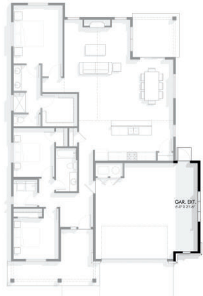
Basement* 1,653 SQ FT