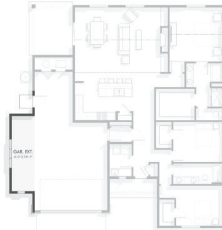
Basement* 1,832 SQ FT